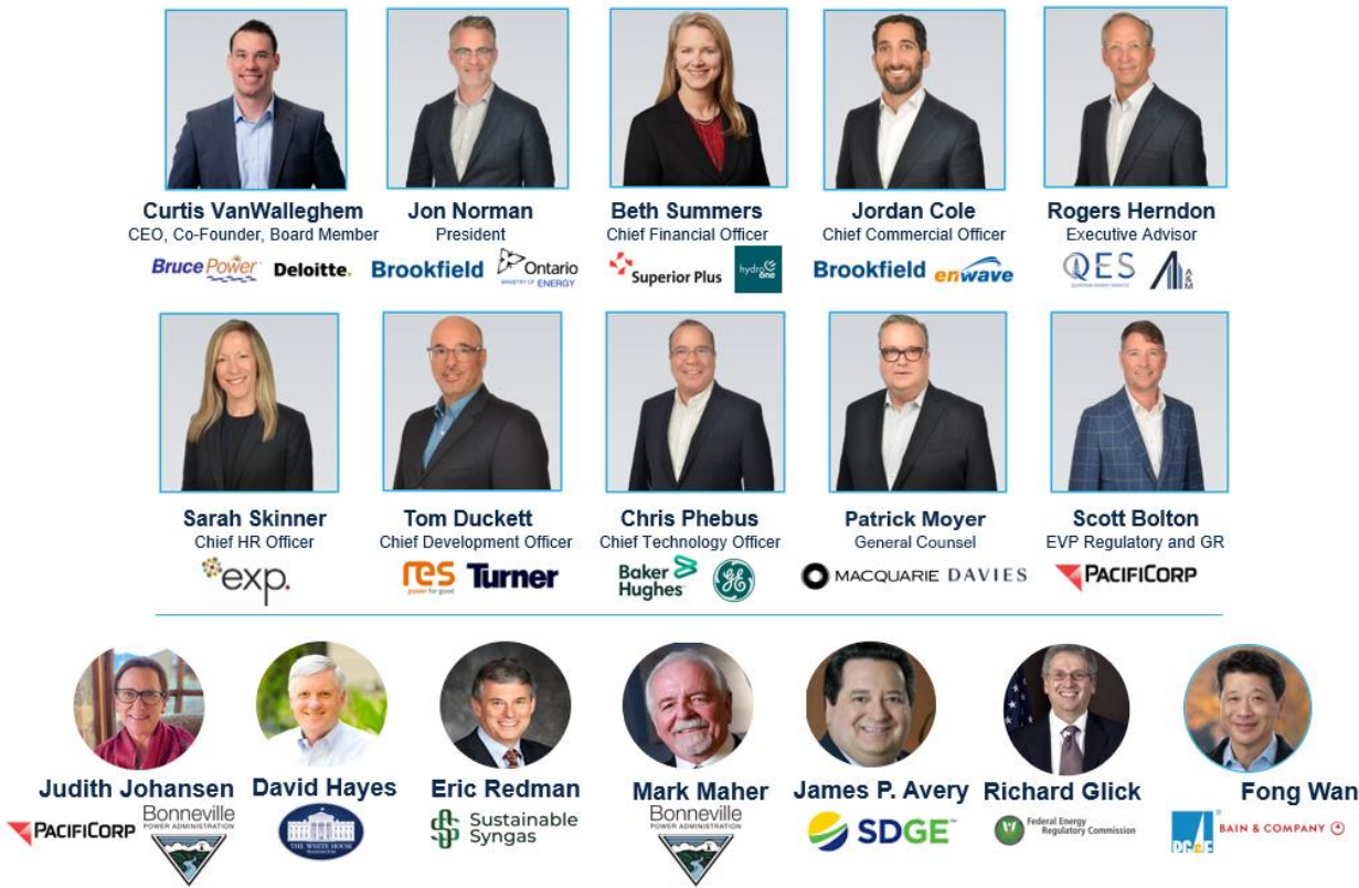
Hydrostor’s Executive team and Advisory Board.

Members of Hydrostor’s team held senior roles at these institutions and managed hundreds of millions of dollars in new infrastructure and renewable energy transactions.