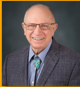
Mayor Joe Hardy